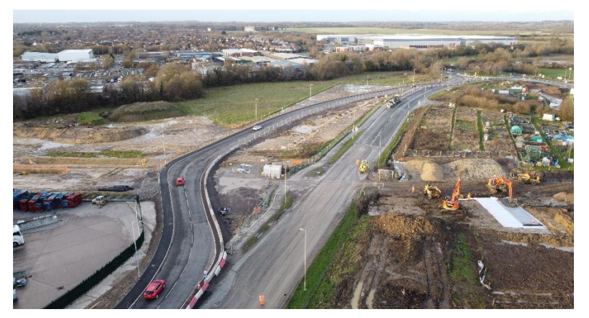
Traffic has been successfully diverted at Charbridge Lane

Now, twelve months on, the main construction compounds are nearly all operational and the highway improvement works are well advanced in all areas across the project. Within the project boundary we have carried out the essential environmental