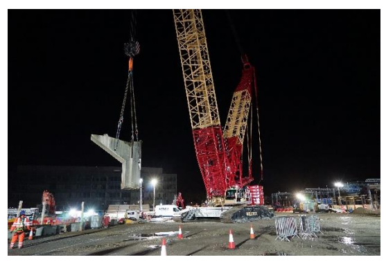
A section of Bletchley flyover is removed

and ecological mitigation works and made the site ready for the new railway construction.