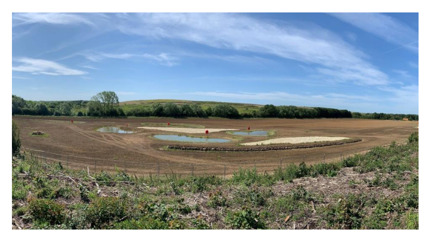
Our Ecological Compensation site near Winslow

With the support of our valued stakeholders we look forward to the exciting things to come in our future Biodiversity Net Gain journey on EWR2.