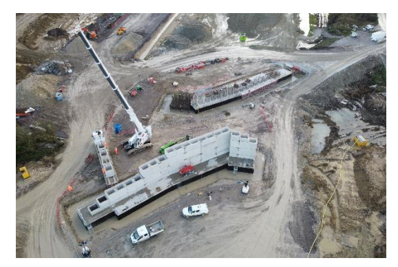
Precast concrete bridge abutments are installed at Station Road

In addition to the dismantling works, over Christmas Day and Boxing day, the team in Bletchley completed a 50-hour possession whilst the West Coast Main Line was closed, installing 130m of new overhead line equipment.