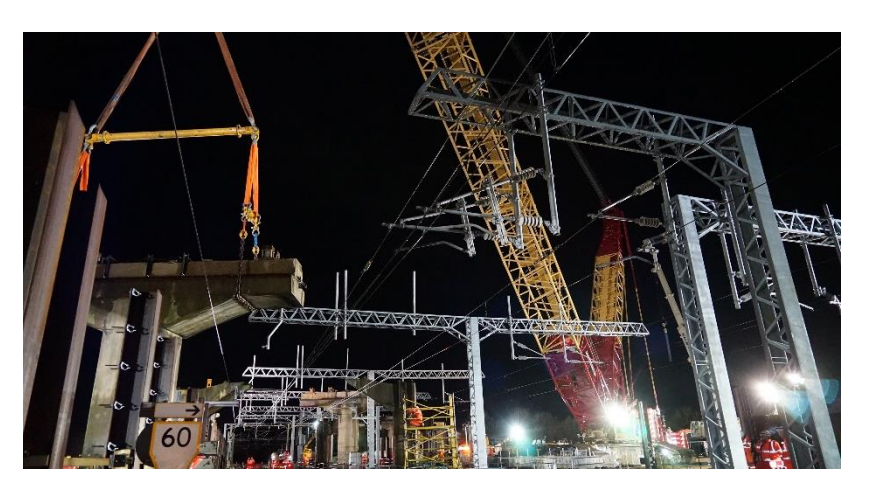
A pier from Bletchley flyover is lifted from the West Coast Main Line

In the early hours of Tuesday 19 January, a new temporary diversion road opened to road traffic on Charbridge Lane. Opening the traffic diversion was a major milestone for the project team, as it means the Alliance can now start to build the new overbridge which will carry traffic over the new East West Rail line once it is built. It is expected that the temporary diversion will be in place until the summer of 2022. During this time access to Tythe Barn and the local allotments will remain in place.